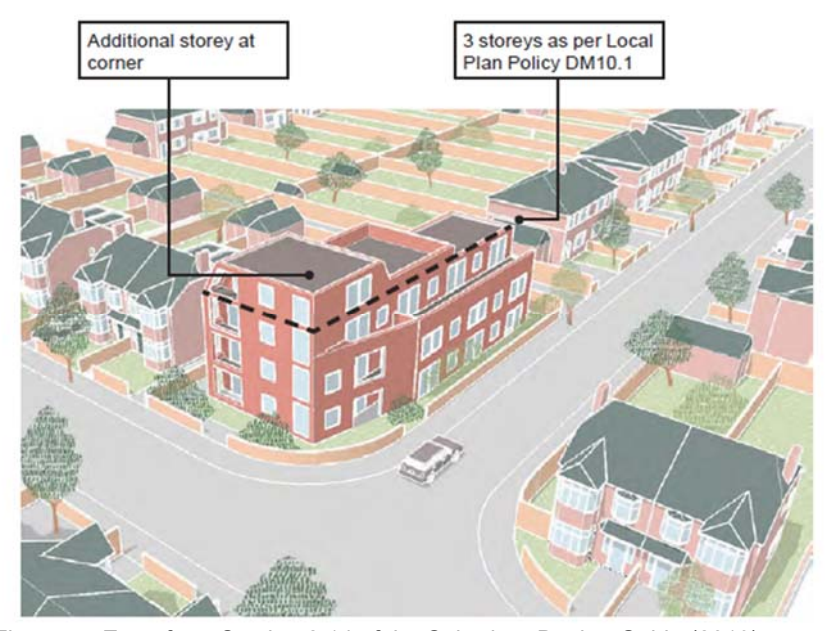
Figure 5 - Exert from Section 2.14 of the Suburban Design Guide (2019)

8.16 The site is a corner plot. The surrounding building form rises up from two storey properties to the proposed development which is a part two, part three, part four storey building. Although it is of a greater scale to that of the immediately surrounding properties, the positioning of the fourth storey at the apex of the corner plot and the stepping down of the roof form close to the southern and western boundaries is compliant with the SDG guidance referenced above. The design and set back of the upper floors assists further in ensuring that the proposal responds appropriately to the surroundings and does not feel overbearing.