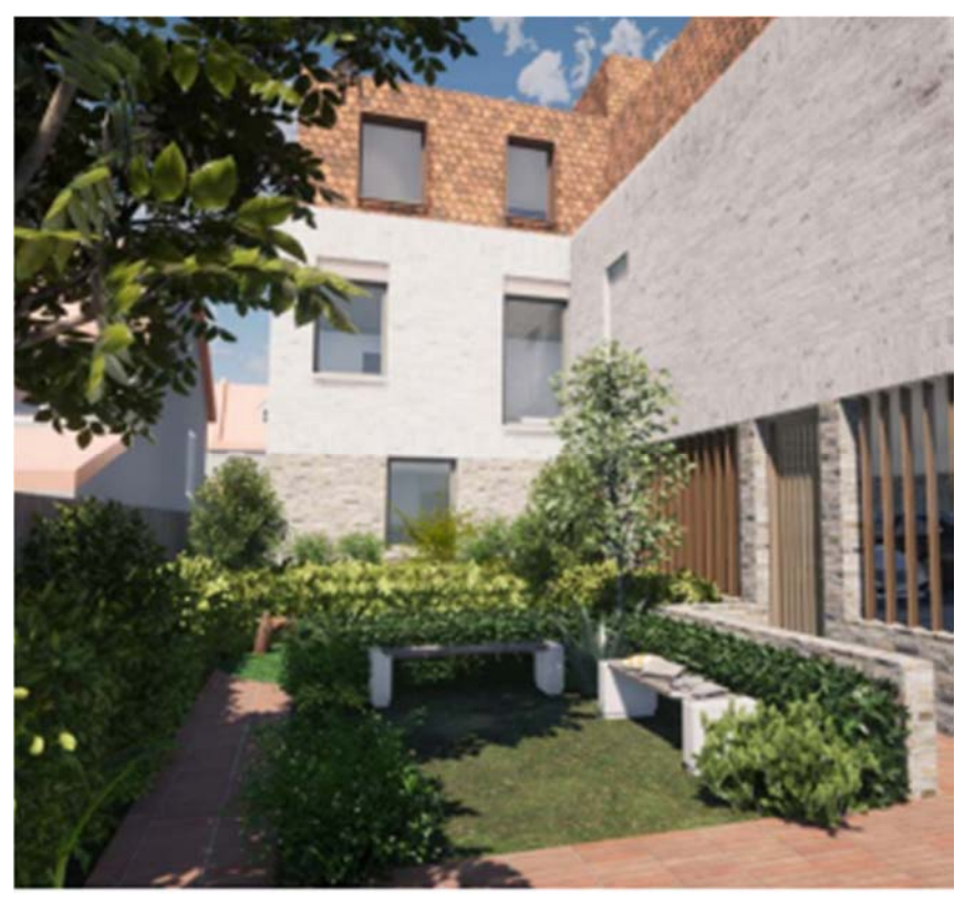
Figure 12 - Proposed CGI of communal space