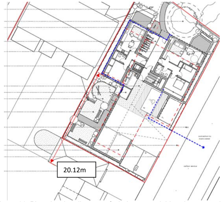
Figure 11: Plan showing distance of windows to neighbouring properties