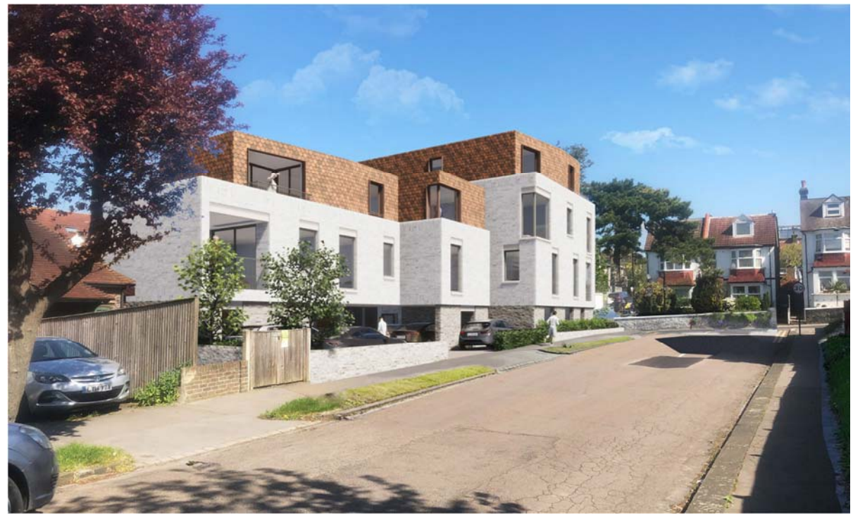
Figure 6 - View looking from Carlton Avenue

8.16 The site is a corner plot. The surrounding building form rises up from two storey properties to the proposed development which is a part two, part three, part four storey building. Although it is of a greater scale to that of the immediately surrounding properties, the positioning of the fourth storey at the apex of the corner plot and the stepping down of the roof form close to the southern and western boundaries is compliant with the SDG guidance referenced above. The design and set back of the upper floors assists further in ensuring that the proposal responds appropriately to the surroundings and does not feel overbearing.