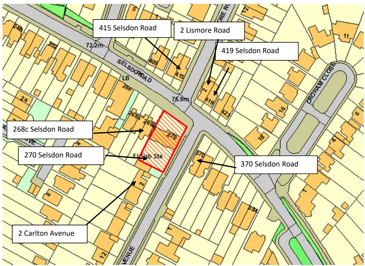
Figure 9: Surrounding neighbours