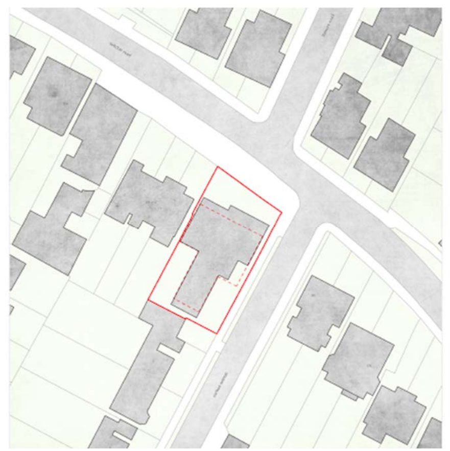
Figure 10: Footprint of proposed and 20/00497/FUL dashed in red.