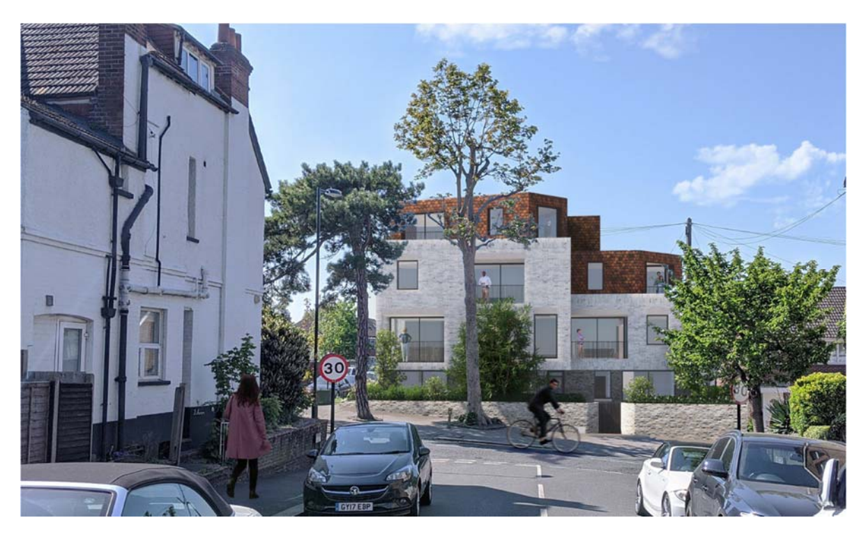
Figure 1 - CGI of front of proposal (northern elevation)